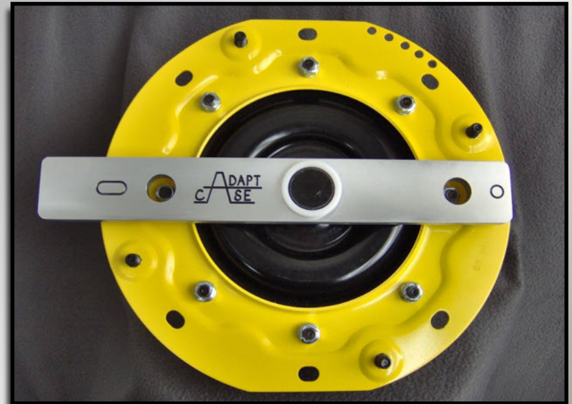
▲ Note the oval engraving on the left of tool and round to the right